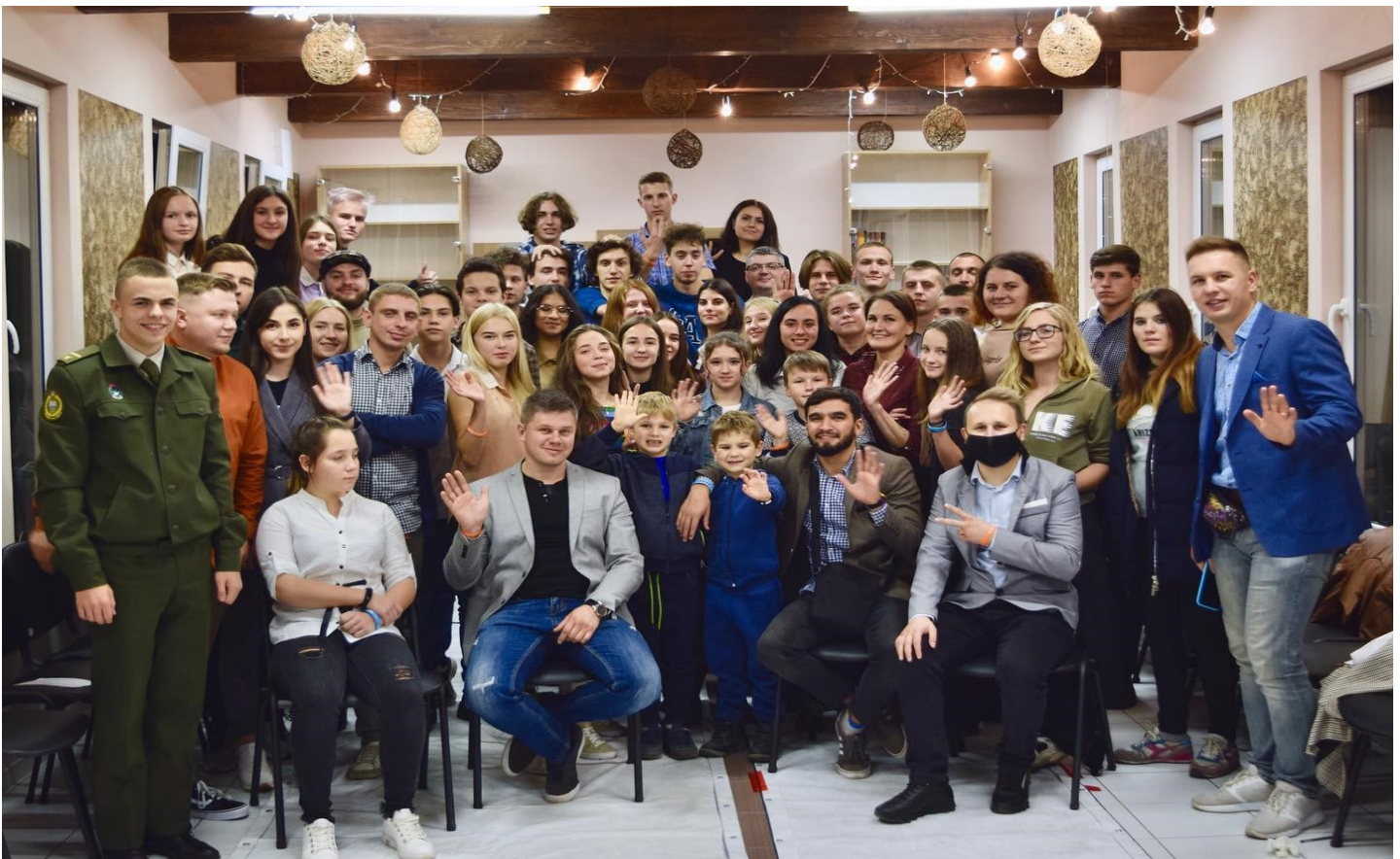
• Youth Conference in Dnipro.