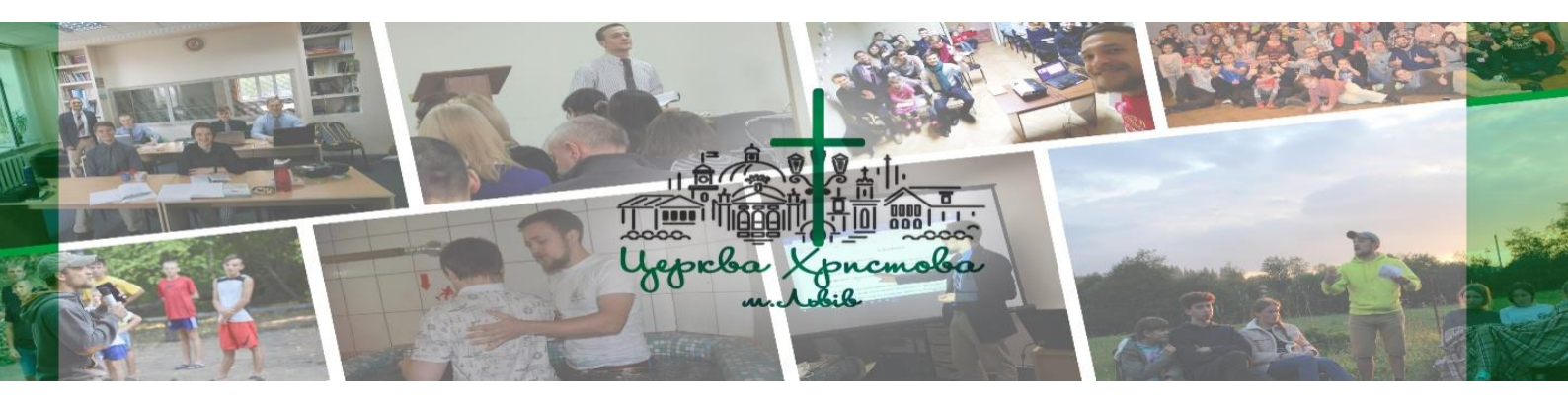
Dear brothers and sisters,

The last two months were filled with ministries in Lviv. We finished studying 1 and 2 Timothy and Titus (which are known as pastoral epistles) with the church on Wednesday Bible classes. We keep on having different meetings on Saturdays: youth group meetings, family meetings, singing practices (where we study how we can praise God more through our singing and learning new worship songs and hymns). We continue reaching out and evangelizing to the people we get in touch with (considering Covid situation). And praise be to God that we have guests at our church regularly: both newcomers and those who attend different church activities regularly (though they are not Christians yet). We continue working with them all, including those who were baptized last year.