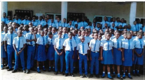
Senior Students of African Christian Secondary School, Usung Atiat