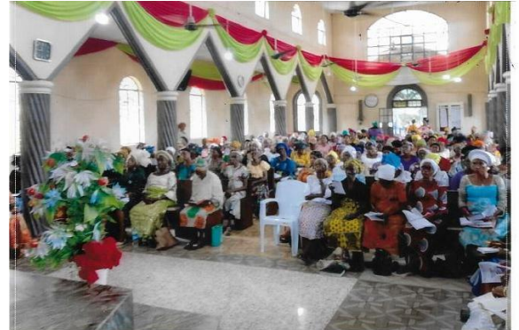
Women Gospel meeting 15th October, 2023 at C.O.C. No. 1, Ukpom