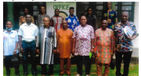
WBS Abak Team during October meeting 26th October, 2023