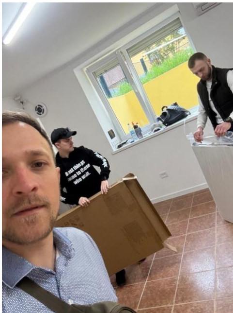
Helping set up the new Drohobych meeting place