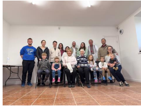
Our team launching the new church in Drohobych