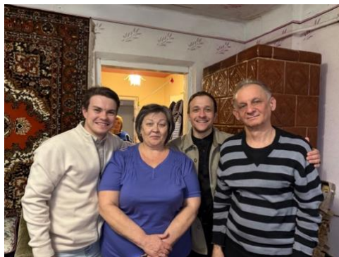
Visiting members during ministry