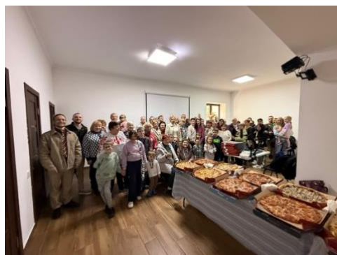
Lunch after Worship at the Lviv Church of Christ