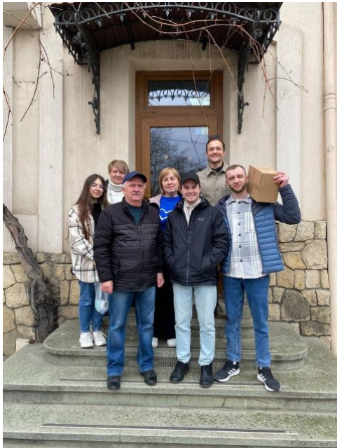
The team that helped find a location for the new church