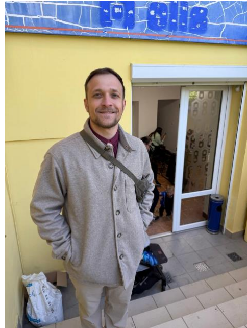
At the entrance of the Drohobych church building