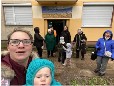
Fellowship outside the Women's seminar