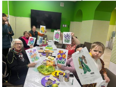
Creative outreach with elderly women and children in Women's ministry in Lviv