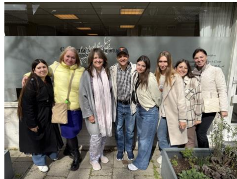
Our group with the church in Eindhoven