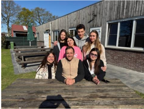
Our Youth team at camp in Belgium