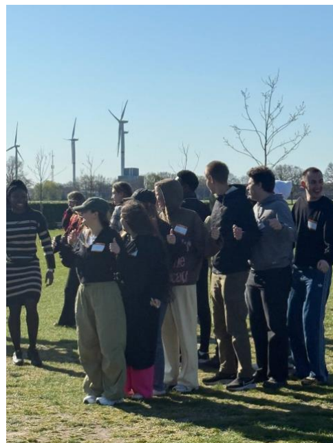
Youth camp group activity outdoors