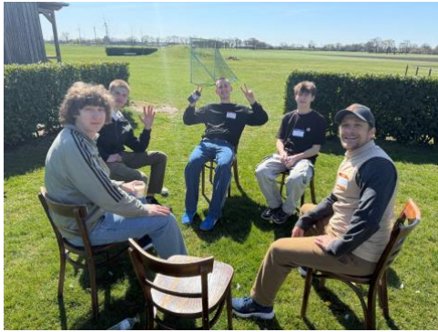
Small group discussion during youth camp