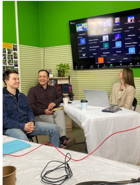
online podcast on the topic of Eldership in the Churches of Christ in Ukraine (as part of the Lviv Bible School)