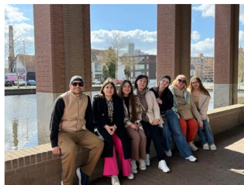
Belgium youth trip