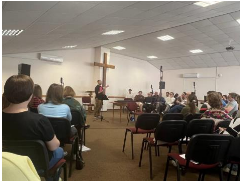
Preaching at seminar in Kyiv