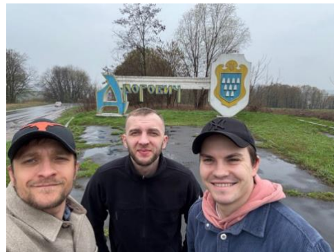
At the Drohobych city entrance with the church planting team